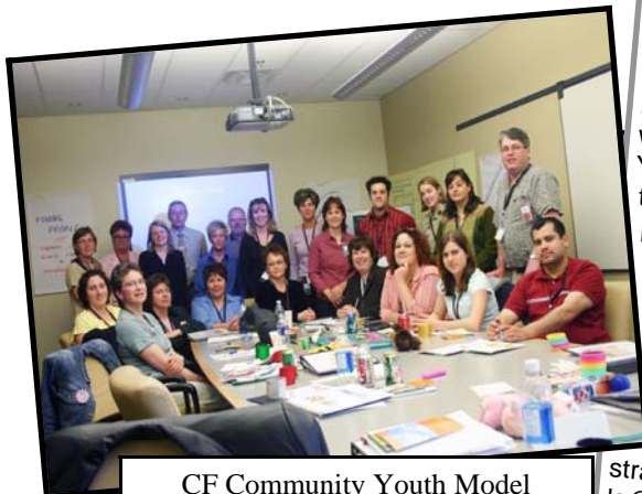
CF Community Youth Model "trainers" in Ottawa—May 2005